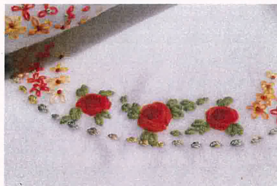
Figure 6: Detail from one of Angela Monitto's wool embroidered blankets.