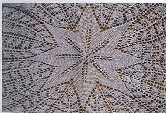
Figure 3: Detail from a doily by Rosa Gandolfo – Enza Gandolfo's mother.