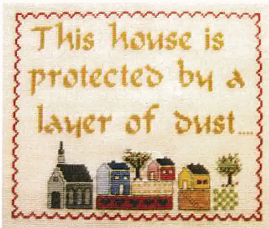
Figure 15: Marilyn Sullivan's cross-stitch.