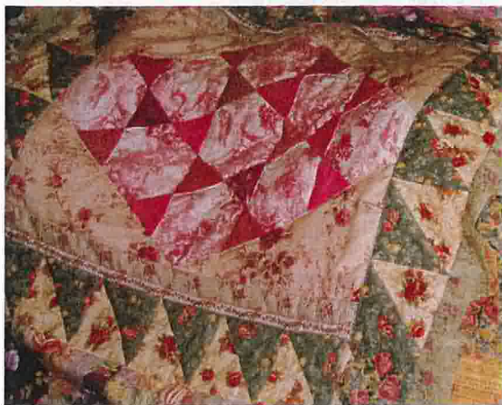
Figure 9: Detail from one of Vicki Cameron's quilts.