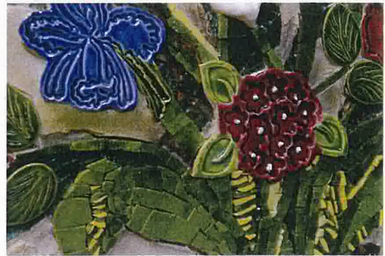
Figure 16: Detail from one of Leonie Scott's mosaics.

community networks and in these contexts they have other identities and roles. Their identities are fluid, multiple and shifting.