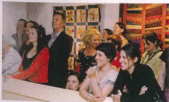
Figure 4: The opening of the 'it keeps me sane' exhibition.