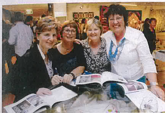
Figure 1: Participants meet for the first time at the 'it keeps me sane' exhibition