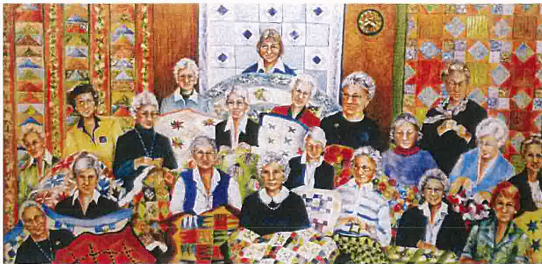
Figure 14: Judith Howard's painting of the Wednesday Quilters.