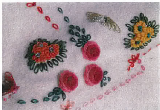
Figure 13: Detail from one of Angela Monitto's wool embroidered blankets.