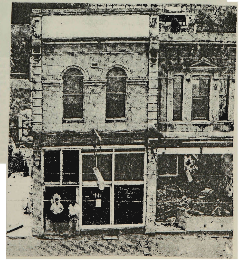
Photo of the two last shops in Happy Valley The "Happy Valley" campaign helped to stop further "slum clearance" by block demolition in Melbourne.