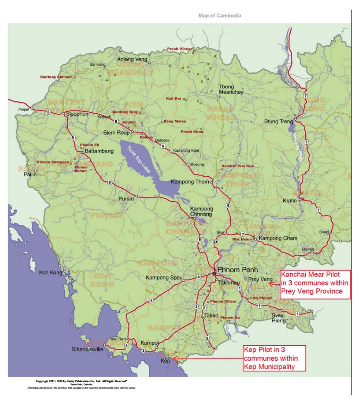
Figure 5. Map of Cambodia showing iREACH pilot sites (Prepared by the iREACH team and published in Unger, B., Huor, C. & Grunfeld, H., 2010).