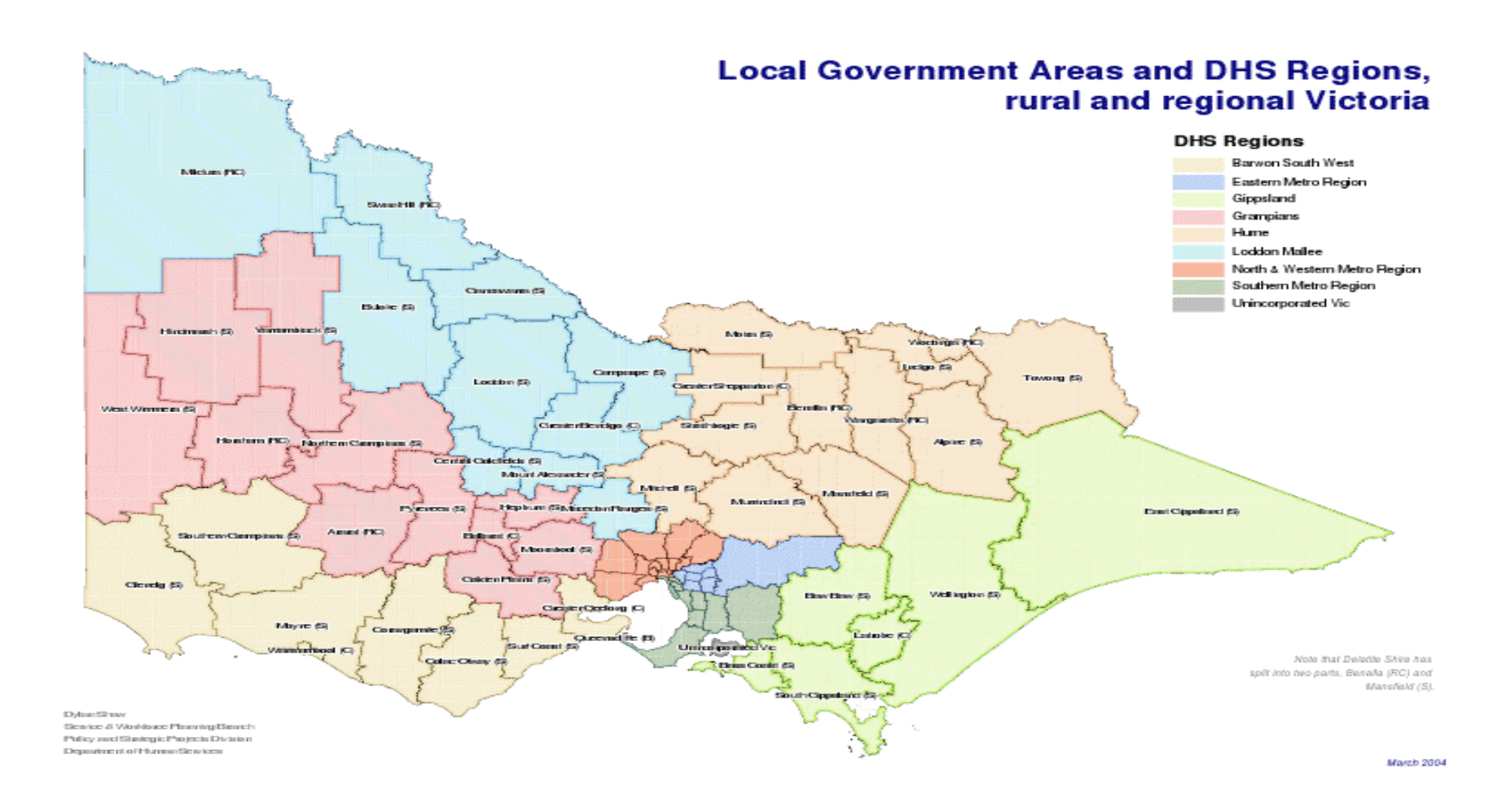
Figure 1. Map of Local Government Areas and Department of Human Services (DHS) Regions in Victoria. Grampians region shown in dark pink (DHS, 2004).