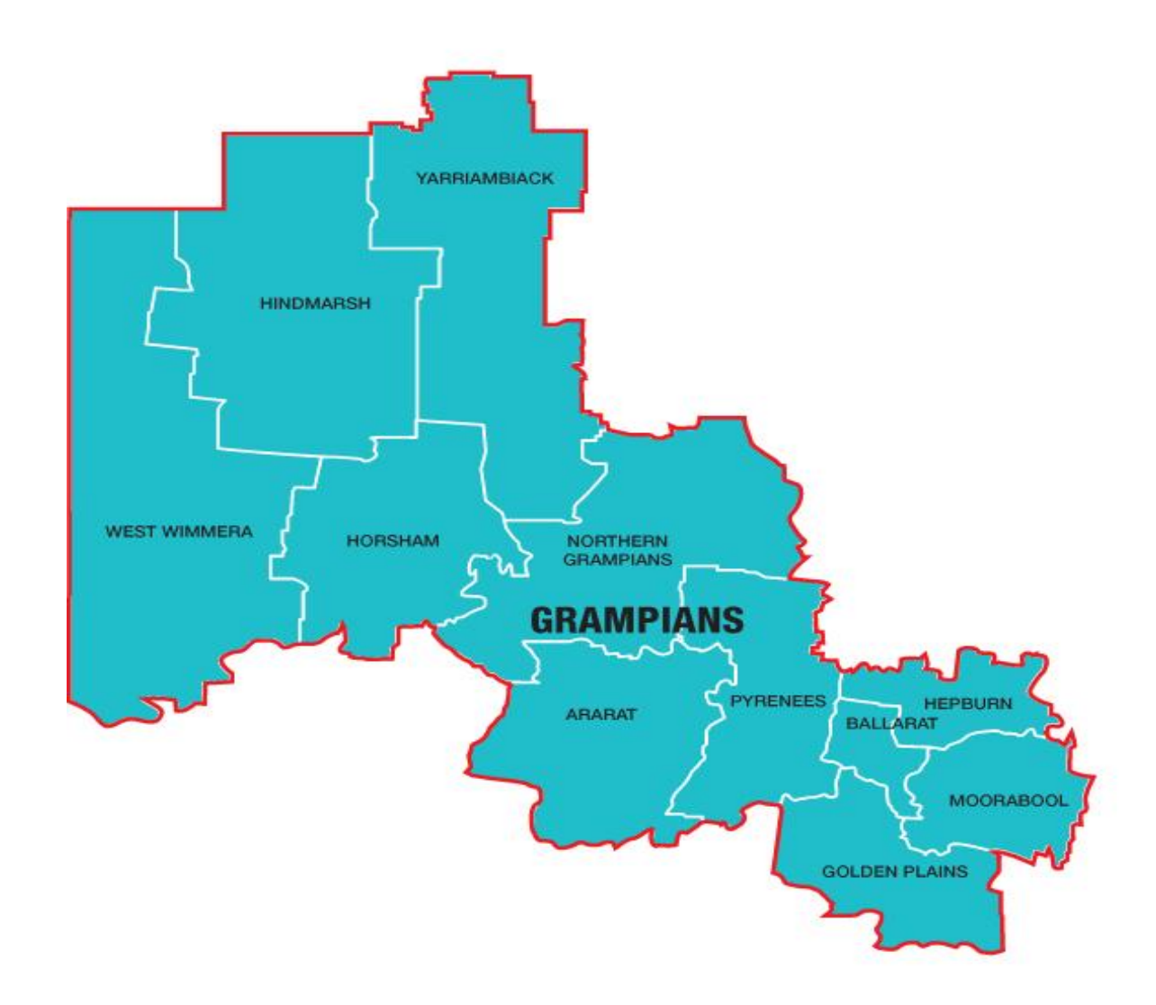
Figure 2. Map of Grampians Region Divided into Local Government Areas (State Government of Victoria, 2010).