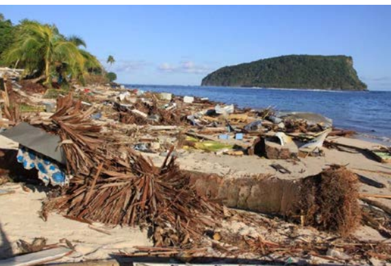
Figure 2: Lalomanu before (left) and after (right) the tsunami on 29 September 2009