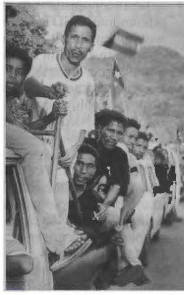
East Timorese going to the polls

Besides seats that were filled on the basis of proportional representation, thirteen seats were allocated to the 13