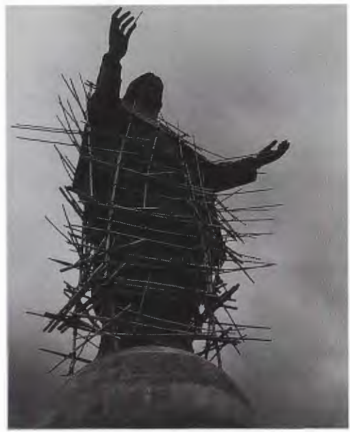
The statue of Christ the King looking out over Fatukama Bay is intended to show recognition of East Timor's Christian identity. But with no sign of official respect for the apsirations of the East Timorese, it may become just another symbol of Indonesian dominance. See page 8 for story.

The occupations at the Dutch and Russian embassies marked a new departure: the East Timorese were accompanied by a number of Indonesian supporters from relatively new organisations such as Solidaritas Mahasiswa Indonesia untuk Demokrasi (SMID - Solidarity of Indonesian Students for Democracy), Solidaritas Perjuangan Rakyat Indonesia untuk Maubere (SPRIM - Indonesians in Solidarity with the Maubere People), and the Centre for Indonesian Workers' Struggle (PPBI). These groups together constitute an umbrella movement known as Persatuan Rakyat Demokratik, or Democratic People's Alliance, formed in May 1994. Knowledge of and support for East Timor's plight have been growing steadily among democrats in Indonesia, who link many of their own democratic aims with the search for self-determination for East Timor. This was their first high-profile demonstration of solidarity. The courage of the Indonesian activists is remarkable given that they would not have been able to secure asylum, in Portugal or elsewhere. One group was forced out of the Dutch embassy after the Indonesian authorities