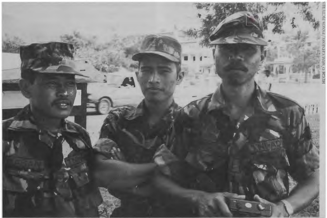
The CNRM peace plan calls for a reduction of Indonesian troops in East Timor to 1,000 within six months.

East Timorese now serving in the Indonesian administration in East Timor, the security forces and police, should not fear an independent East Timor. They will be invited to stay on as their full and active involvement in running the