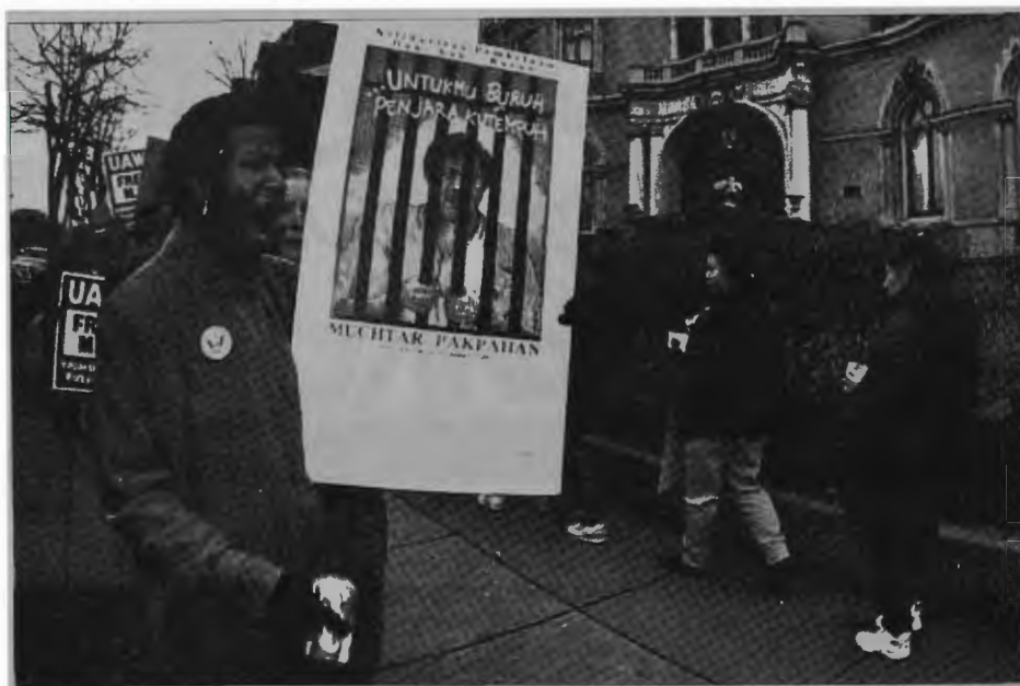
US trade unionists demonstrating for the release of Muchtar Pakpahan at the Indonesian embassy in Washington

Muchtar Pakpahan has arguably become Indonesia's most famous political prisoner; whenever Suharto pays a foreign visit, most recently to Vancouver and Pretoria, the issue of Muchtar Pakpahan continues to haunt him. During Suharto's visit last year to North America, the Pakpahan issue became quite an embarrassment. As soon as they shook hands, President Clinton immediately asked Suharto about Pakpahan's health. The Canadian government went even further by sending a specialist medical team to Jakarta to check on Pakpahan's medical condition. As a guest in Canada, Suharto could hardly have rejected the offer. Pre-