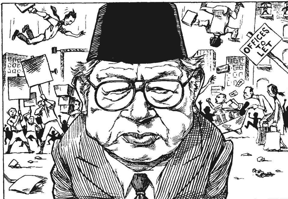
The Economist, 17 January 1998

The huge informal sector is the only safety net for the unemployed, whose numbers have swelled, bringing more people onto the streets to eke out a living.