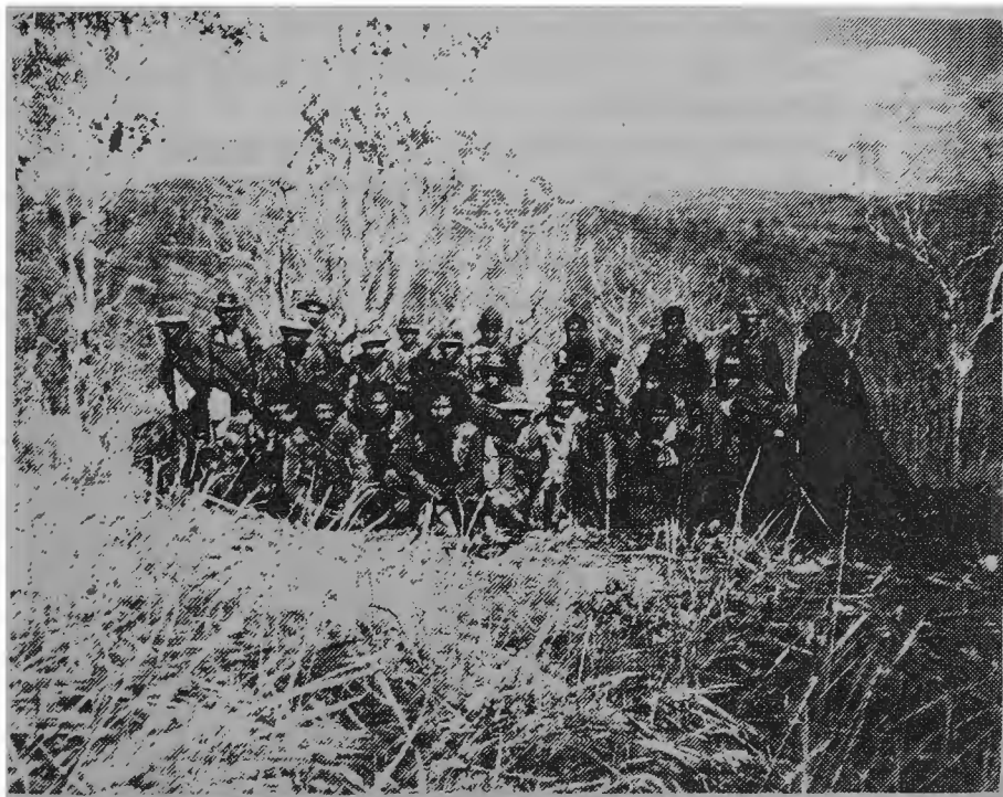
A recent picture of a genuine Falintil unit, somewhere in the bush.