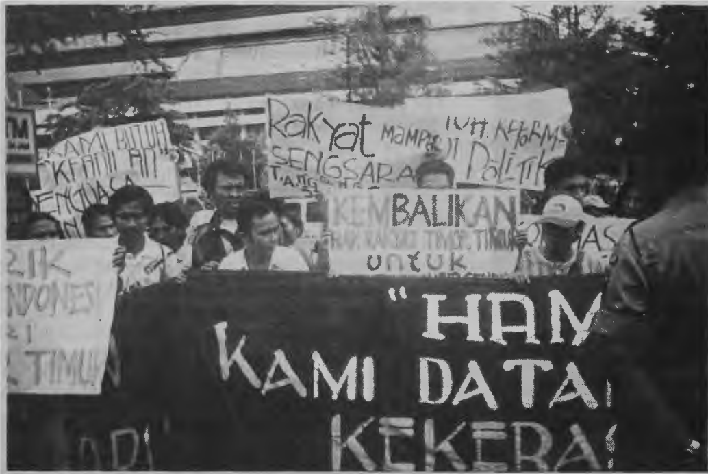
A demo in Semarang, Central Java on Human Rights Day, 10-12-1997, to support the East Timorese demand for self-determination and the withdrawal of Indonesian troops.

A number of East Timorese who until recently collaborated with the Indonesian administration have joined together to set up a new organisation which calls for national unity and reconciliation of the people of East Timor as the way to work for a solution the question. The initiative comes at a time when the army of occupation has had to devise a new strategy against the armed resistance.