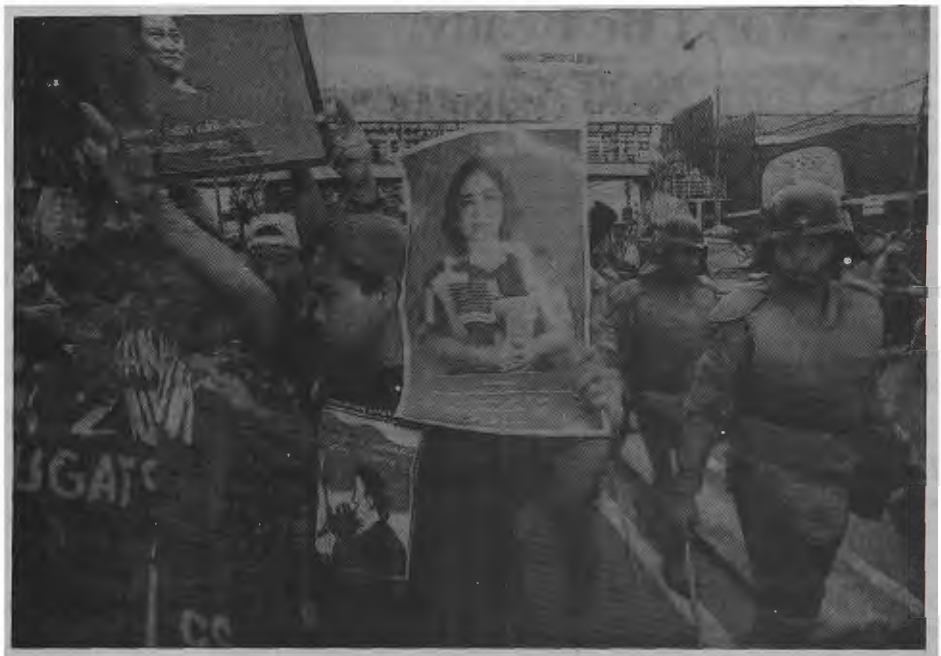
Megawati supporters demonstrating in Jakarta, a daily scene in the main cities.

No one was surprised when Suharto announced that he would stand for a seventh term but strong hints that he had