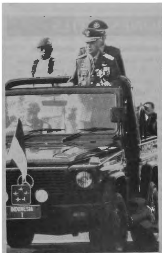
Five-star General Suharto in a rare photo wearing his military uniform on Armed Forces Day, 5 October 1997.

The economic meltdown quickly turned into a political crisis and the two IMF rescue operations [see separate article] have failed to help. Major business weeklies like The Economist and Business Week are saying that Suharto must stand down if confidence is to be restored.