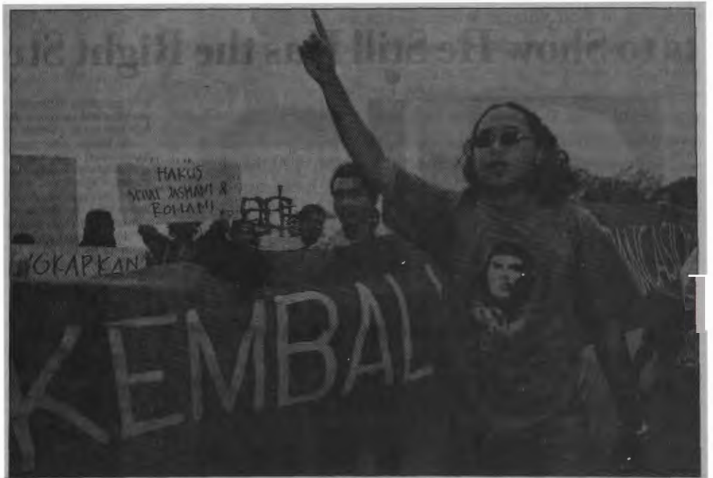
A demo at the DPR, the National Parliament.

A week earlier a minor incident in Bandung between hundreds of street hawkers and the authorities erupted into a huge conflict. Local officials had launched a national discipline campaign. To keep the streets tidy during the day, they wanted to restrict trading hours for hawkers to late evening which would have ruined their business. In the main thoroughfare of Cicadas, angry hawkers attacked shops till sunset when the day's fast ended. More than