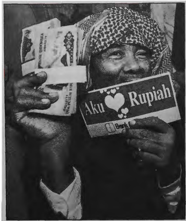
The 'I love the Rupiah' campaign initiated by Tutut Suharto was stillborn.

There are two likely scenarios for the succession. The first accepts the premise that things will go on as usual, that Suharto will be re-elected, with uncertainty about the vice presidency. Suharto may not survive for another five years or he may hand over in a couple of years' time, leaving the vice president in charge.