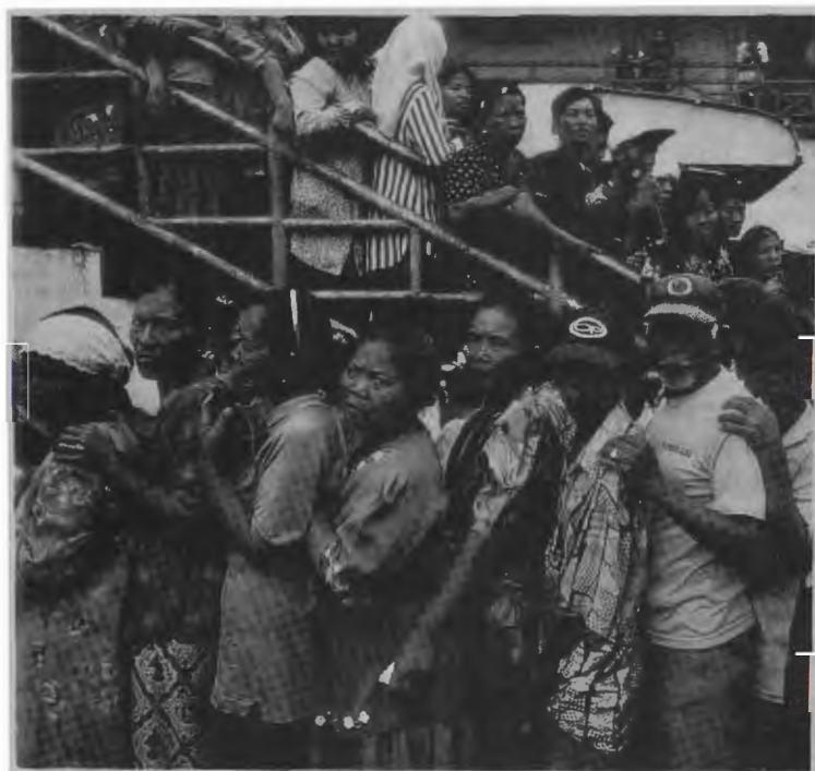
People queuing for rice in Jakarta

Asian crisis. It was applying remedies to state budgets, insisting on tight money policies and sharp cuts in government spending whereas the crux of the Asian disease was the private sector debt which had grown out of all proportion as western financiers had eagerly provided credit to all and sundry. In truth, western banks would become the ultimate beneficiaries of the bailout while Asia's millions of impoverished peasants and workers would pay for the remedies in soaring prices, unemployment and falling living standards.