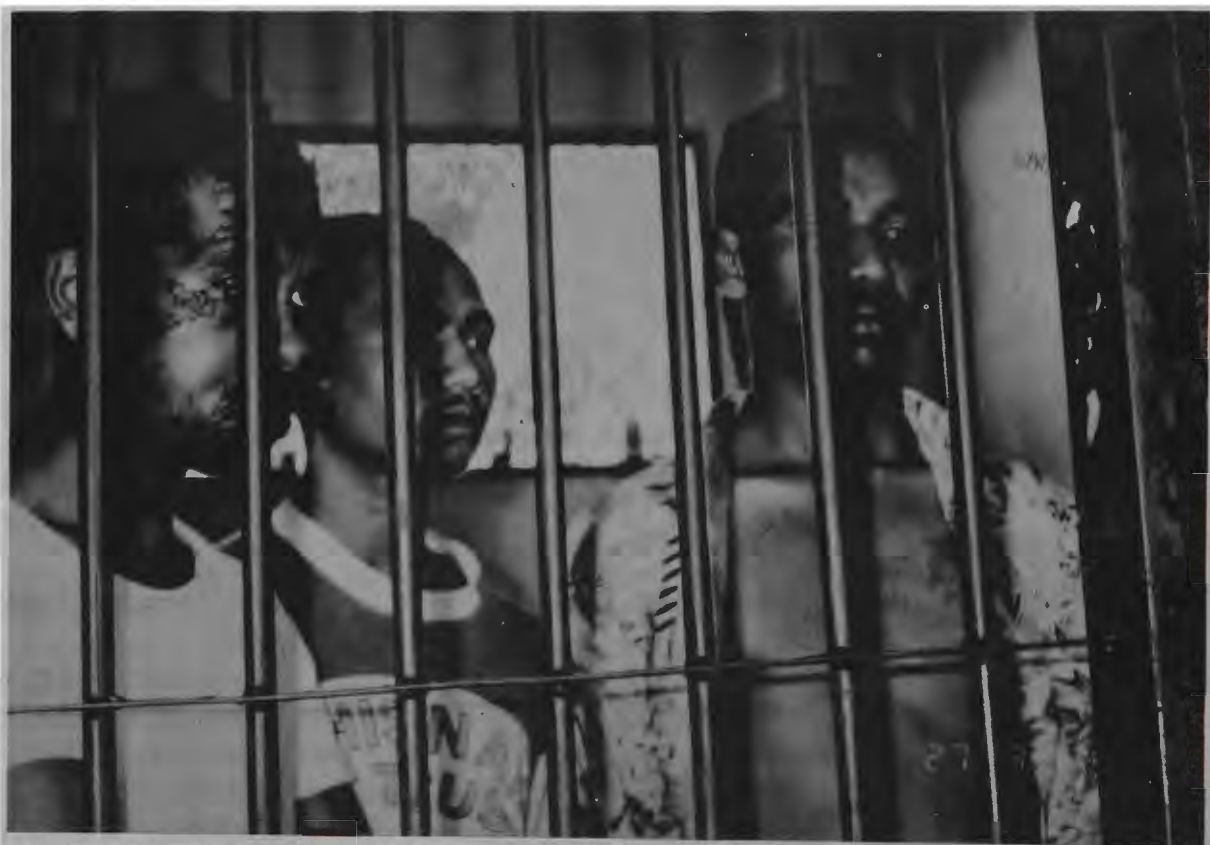
Timorese demonstrators after an encounter with the security forces.