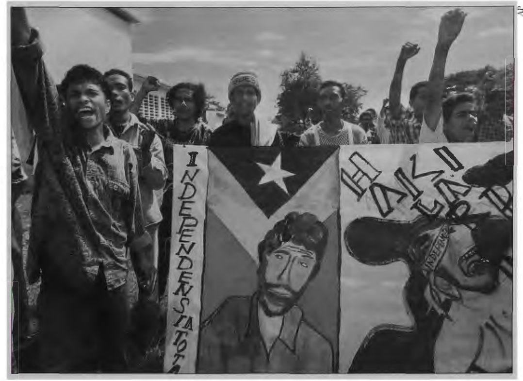
Demonstrators call for Xanana Gusmão's release. His freedom could unlock the negotiations over East Timor's future.

To the people of East Timor, Xanana has become a symbol of their struggle for freedom, the key person in the political negotiations for