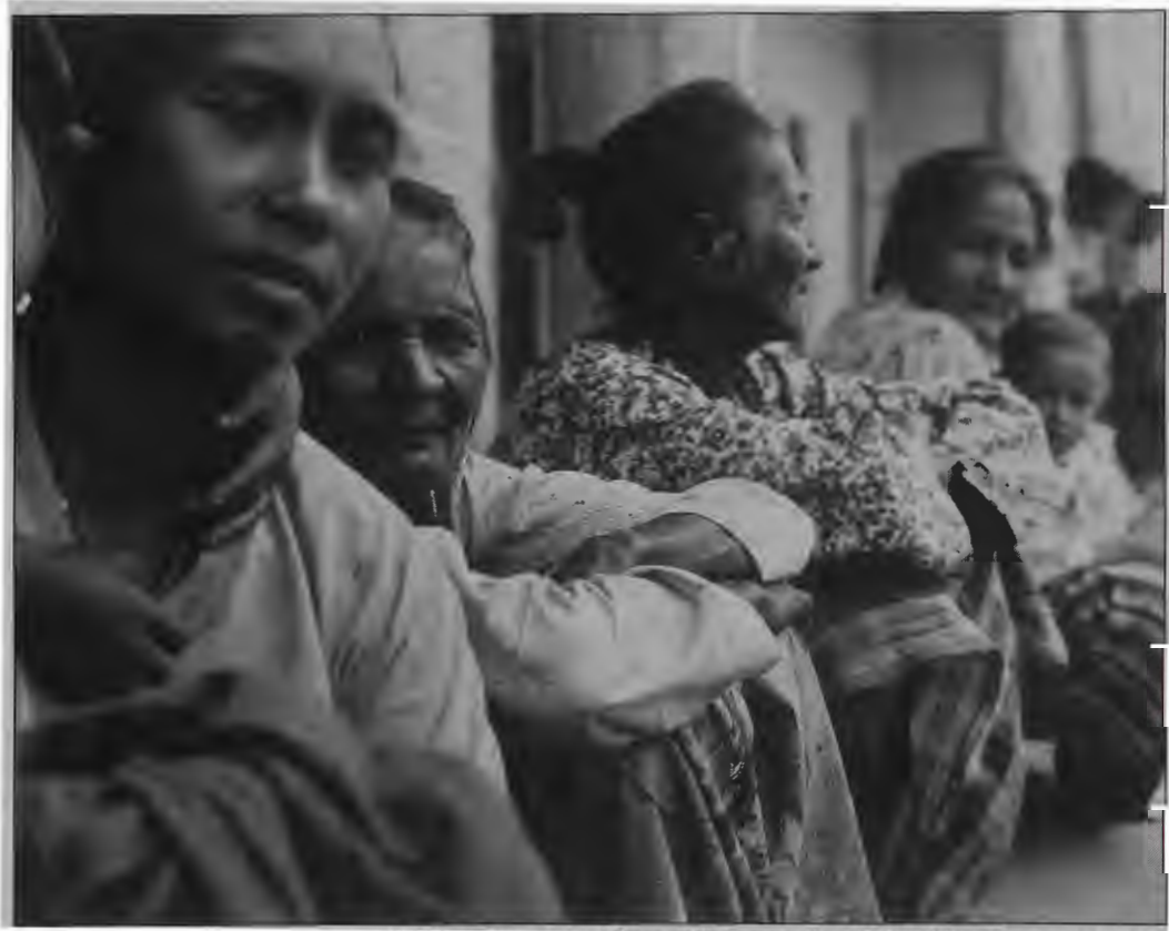
Women in Los Palos wait for aid that has just arrived from Dili, September 1999. Now the emergency is over, development efforts must focus on increasing women's participation in decision-making.