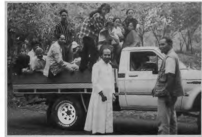
Ermera's parish priest on the road with some of his parishioners.

militias last year, a considerable amount of church infrastructure must now be rebuilt. The Church agrees with the priorities for national reconstruction set by the recent congress of the National Council of Timorese Resistance (CNRT), as well as those set by the CNRT/UN transitional government. But its immediate conerns include evangelisation and the following social and pastoral priorities: