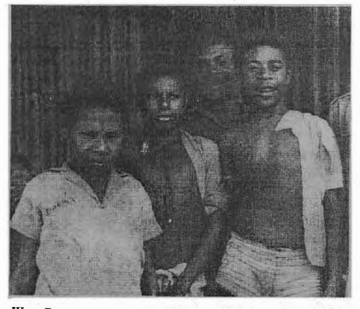
West Papuan refugees in PNG.

August 22, reports of more Indonesian troops moving towards Okma and Oksil areas in West Sepik province [Post-Courier 23/8/90]