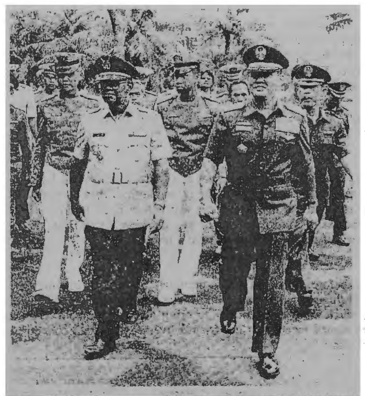
General Try Sutrisno – ABRI Commander in Chief and Bakorstanas chief (right).

The 'G30S/PKI' label is used for many millions of Indonesians deemed to have been members or sympathisers of the PKI or the many mass organisations outlawed in 1965. The regime alleges that the PKI was responsible for the 30 September 1965 Movement known as the G30S. Hence, by association, all these millions are deemed to have been 'involved' [terlibat] in the G30S. When making the new regulations public, several senior army officers stressed that the authorities had so far been able to track down 'only 2 million' (according to some accounts, 'only 1.6 million') of the 20 million people who were in the PKI or related mass organisations, so another 18 million must still be found. [Jakarta Post, 20 July 1990]