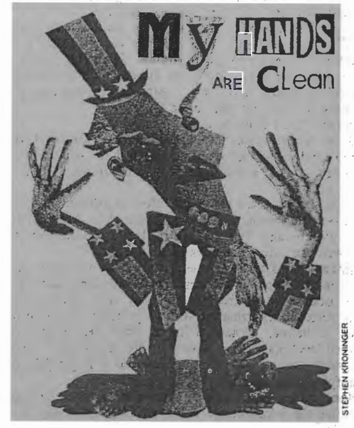
Village Voice 12 June 1990 the second as for the second to be the second

Tapes. Declassified cable traffic between the US embassy and the State Department during the months from 1 October 1965 shows how the embassy aided and abetted the army's death squads. According to an embassy cable to the State Department on 4 November 1965, "DCM [deputy chief of mission, Jack Lydman] made clear that embassy and USG generally sympathetic with and admiring of what army doing". A collection of some of the more revealing cables