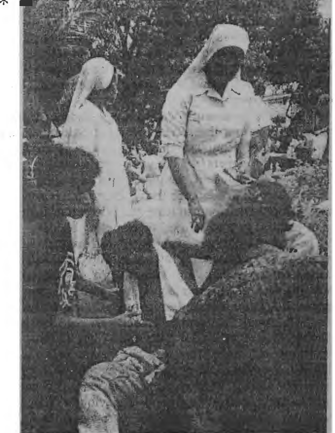
Wounded East Timorese students tended by Red Cross nurses in the garden of Mgr.Belo.

13 September. Sources in Dili say that the situation in Dili is very tense, with Indonesian soldiers in civilian clothing, roaming the streets wielding batons, iron bars and other implements, beating up people. Things were so bad by mid September that Timorese were afraid to venture out after dark.*