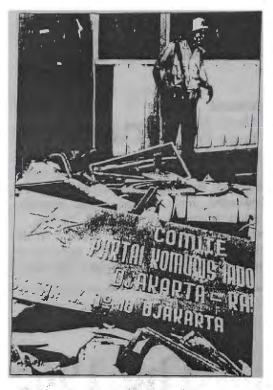
PKI building ransacked in 1965.

Lydman: I think he was pretty good at that. [K: Going down to the lower levels.] He probably did more to clarify