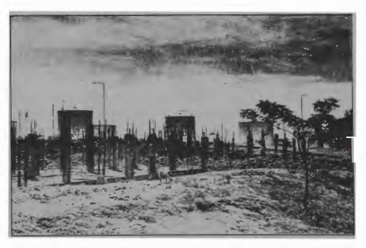
The disputed land, with Training Centre already being built. (Tempo 24 June 1978)