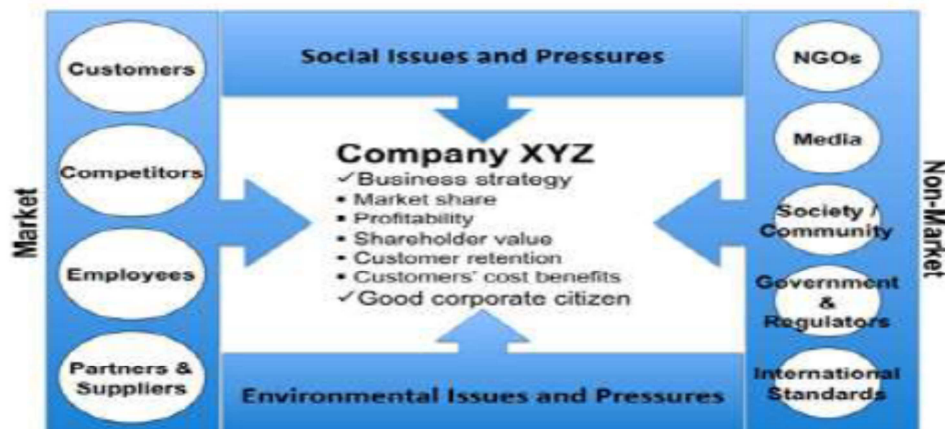
Figure 2. Market and Non-market Environments

On the other hand, the non-market elements are everything that affects the market indirectly. Also unlike the market characteristics, non-market's characteristics (see the following Figure 2) are that they: vary from place to place, are immeasurable, information is the medium, and the rules are mainly complicated and hard to deal with. Here, the Governments, regulators, media, NGOs, citizens, activists are the elements of the non-market environment (Baron 1995a, 1995b, 1997, Yuanqiong, Zhilong & Yun 2007, Zhilong & Haitao 2006, Marc & Patrick 2005).