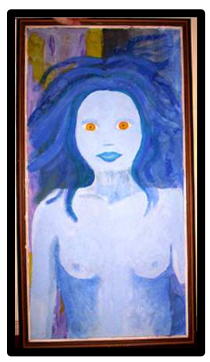
Sara Wilson, The Blue Lady , 1998, acrylic on canvas, 129.4 x 69 cm. Collection of the artist.

narrative in one work, as does the title of a work from 1962 'Escape from Morality" (p. 6). The majority of the works in the CDC completed by women are from the 1960s and to a lesser extent the 1950s. This balance was also reflected in the work selected for the exhibition.