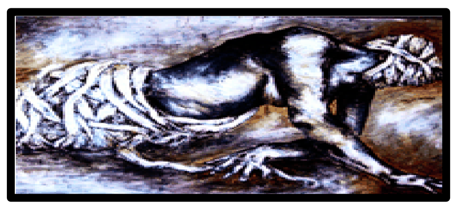
Donna Lawrence , Empower Me (2) , 2006, oil, acrylic and collage on canvas. 40.6 x 122 cm. Collection of the artist.

I would like to acknowledge the women in this exhibition for their compelling works that stare at us and challenge us to reflect upon their resilience and creative responses to the circumstances in which they live/d and consider the conditions within society which impose a major mental health burden via gender discrimination, poverty, social position and various forms of violence against women. I also hope this exhibition has inspired viewers to consider their own relationship to creativity and wellbeing and to question what art does, as these works have provoked me to do.