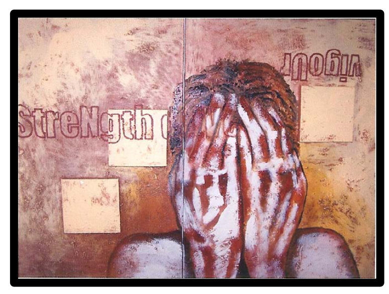
Donna Lawrence , Untitled , 2006, oil, encaustic and collage on canvas, 100 x 75 cm each. Collection of the artist.