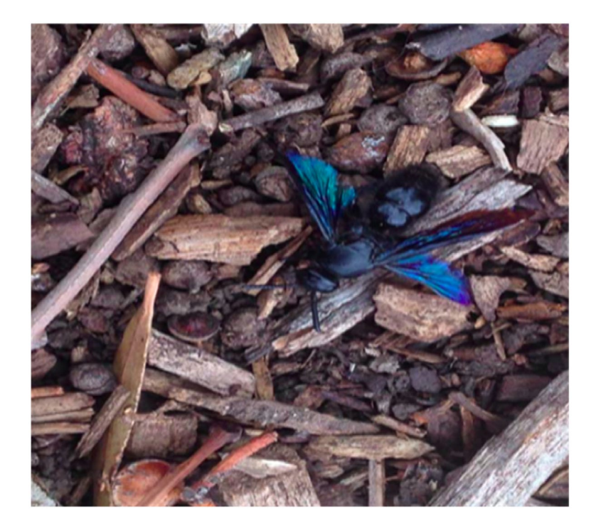
Figure 3. Blue-winged Flower Wasp.

called into connection by the more-than-human they encounter and then figuring out what it might mean to actively respond. This is a strategy intended to help teachers make the paradigm shift that is necessary for moving away from a focus on matters of fact towards matters of concern. Lively stories not only document modest witness(ing) but they have the potential to call readers (and in our case teachers) into connection and setting into motion response-ability. For Rose (2013), responding begins to actualize the connection and the commitment with significant otherness.