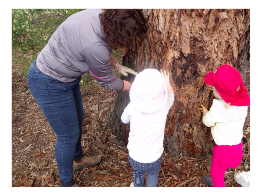
Figure 2. Making connections in the Bark Studio.