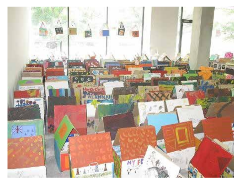
Figure 4: One Thousand Box neighbourhood