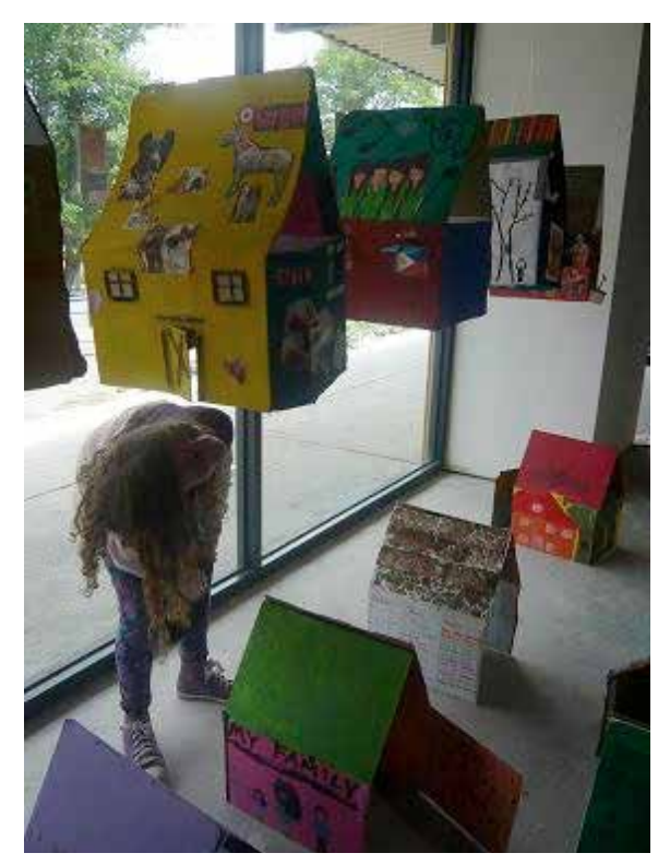
Figure 3: One Thousand Boxes