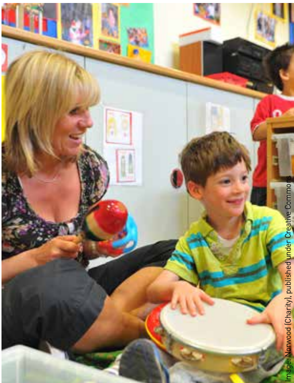
Returning to school, day care and pre-school routines assists with the restoration of social networks and supportive structures.

Youth participation, as a concept, is not only about providing developmental opportunities for young people, it is also about improving the effectiveness of organisations. By tapping into the experiential knowledge of young people there is increased opportunity to ensure that a program is actually meaningful and operating in the best interests of the child.