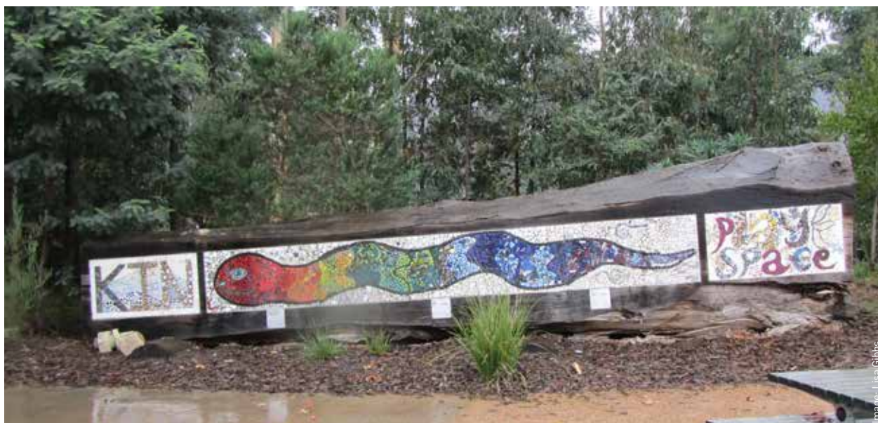
This mosaic is a feature of 'Kin Play-space' in the township of Marysville, Vic, which was devastated by the Black Saturday bushfires in 2009. The Kin Play-space is on the site of the former kindergarten and provides a place of quiet reflection and the extension of exploratory play for children.