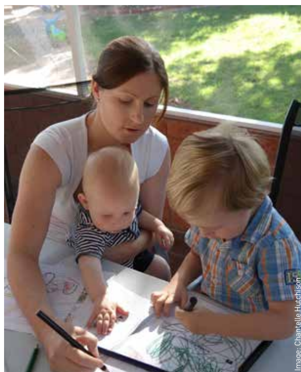
Talking and sharing experiences include playing games and using other ways to express thoughts and feelings.