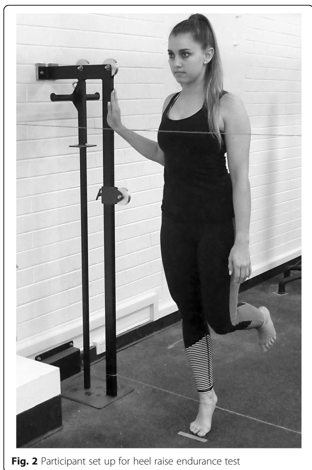
Fig. 2 Participant set up for heel raise endurance test

using a choice of electronic or paper monthly diary entries. They will record: training distance (km), training type (long run, easy run, tempo/race pace run, interval/speed run, walk, strength training, sports match), training duration (minutes), races completed, race distance, race type (trail, road, triathlon, Iron Man), changes in footwear, illness, injuries and subsequent time off running. An injury will be defined as a musculoskeletal impairment for which a participant takes more than seven days off weight bearing activity or seeks treatment from a health professional. For any injury, participants will be required to complete a Sports Medicine Australia Sports Injury Tracker Report [53]. Data will be collated monthly and followed up if not returned. In the case of any injury, participants will be required to immediately notify the chief investigator, who will clarify details of the injury. Upon suspicion of MTSS, participants will be required to attend a follow up session at the Biomechanics Research Laboratory to confirm a diagnosis of MTSS. MTSS will be defined as diffuse pain induced by exercise along the posteromedial tibial border that is non-inclusive of pain from ischaemic origin or stress fracture [2]. Participants, who develop lower limb injuries other than MTSS,