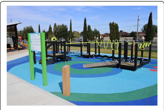
Fig. 2 The Senior Exercise Park (Lark Industries and Lappset Group) at Thomastown, Melbourne Victoria

The Senior Exercise Park equipment (Lark Industries, Australia) is outdoor playground equipment specifically designed for older people to improve strength, balance, joint movements and overall mobility and function (Fig. 2). It comprises multiple equipment stations that target specific function or movement (upper and lower