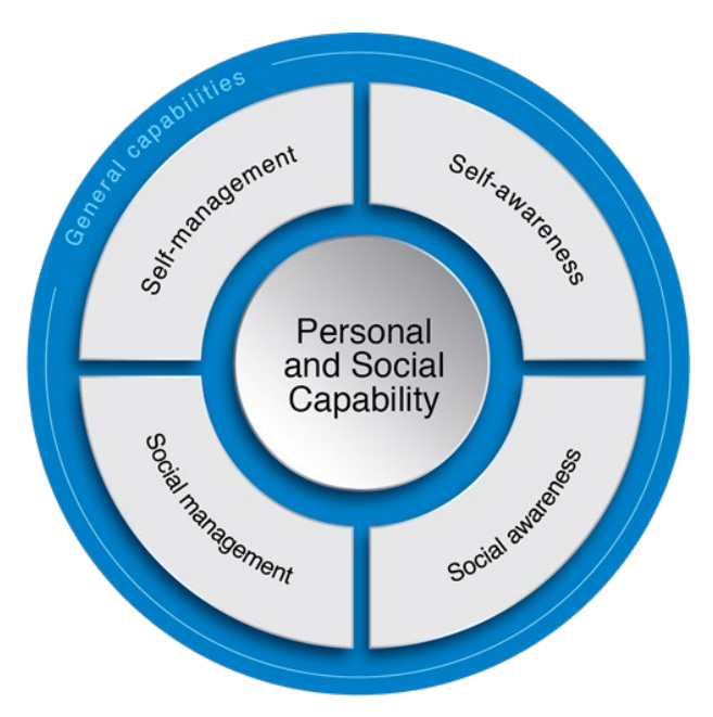
FIGURE 3: AUSTRALIAN CURRICULUM, F-10 CURRICULUM, GENERAL CAPABILITIES, PERSONAL AND SOCIAL CAPABILITY

Capabilities taught in Australian schools include: Critical and Creative Thinking, Ethical Understanding and Intercultural Understanding and Personal and Social Capability. The focus of this learning is shown in Figure 3.