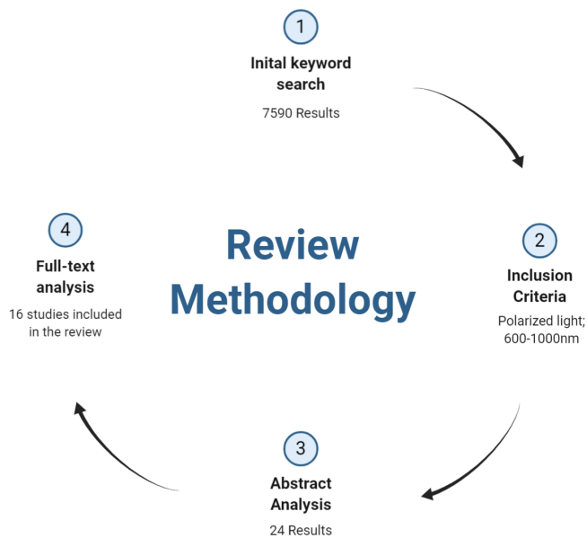
FIGURE 1 Summary of search strategy and paper exclusion

only, polychromatic light, or light outside of the 600 to 1000 nm range were omitted. Non-English articles that were not able to be translated were excluded. Initial search identified 7590 entries. After exclusion of duplicates and conference abstract titles, an abstract analysis was used to identify potential items. Full-text analysis of all papers was performed to assess appropriateness for inclusion in this review. Reference lists of included articles were also used to locate additional relevant articles. In total 16 number of studies were found related to red and NIR PPBMT (Figure 1). No ethical approval was required for this review.