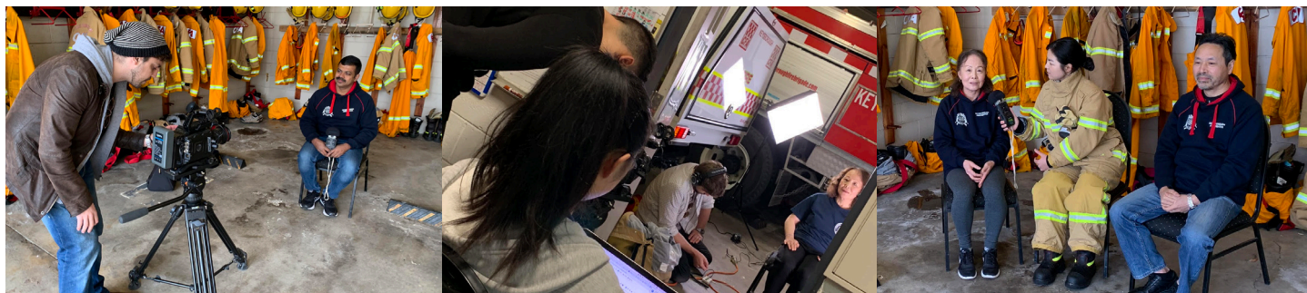
Making the 'We speak your language' short films.

'How well we are connected with our multicultural communities determines how well you can get the job done.' — CFA Member