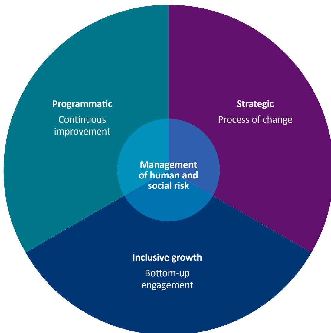
Figure 3: Diversity and inclusion framework components (Young and Jones, 2020)

Each section incorporates key findings from the research and fifteen industry case studies. These case studies provide examples of effective outcomes throughout the EMS. They reflect the variability of D&I practice and the different contexts and approaches that are used. They also illustrate the importance of not only acting at a context level, but working as and being part of the emergency management system.