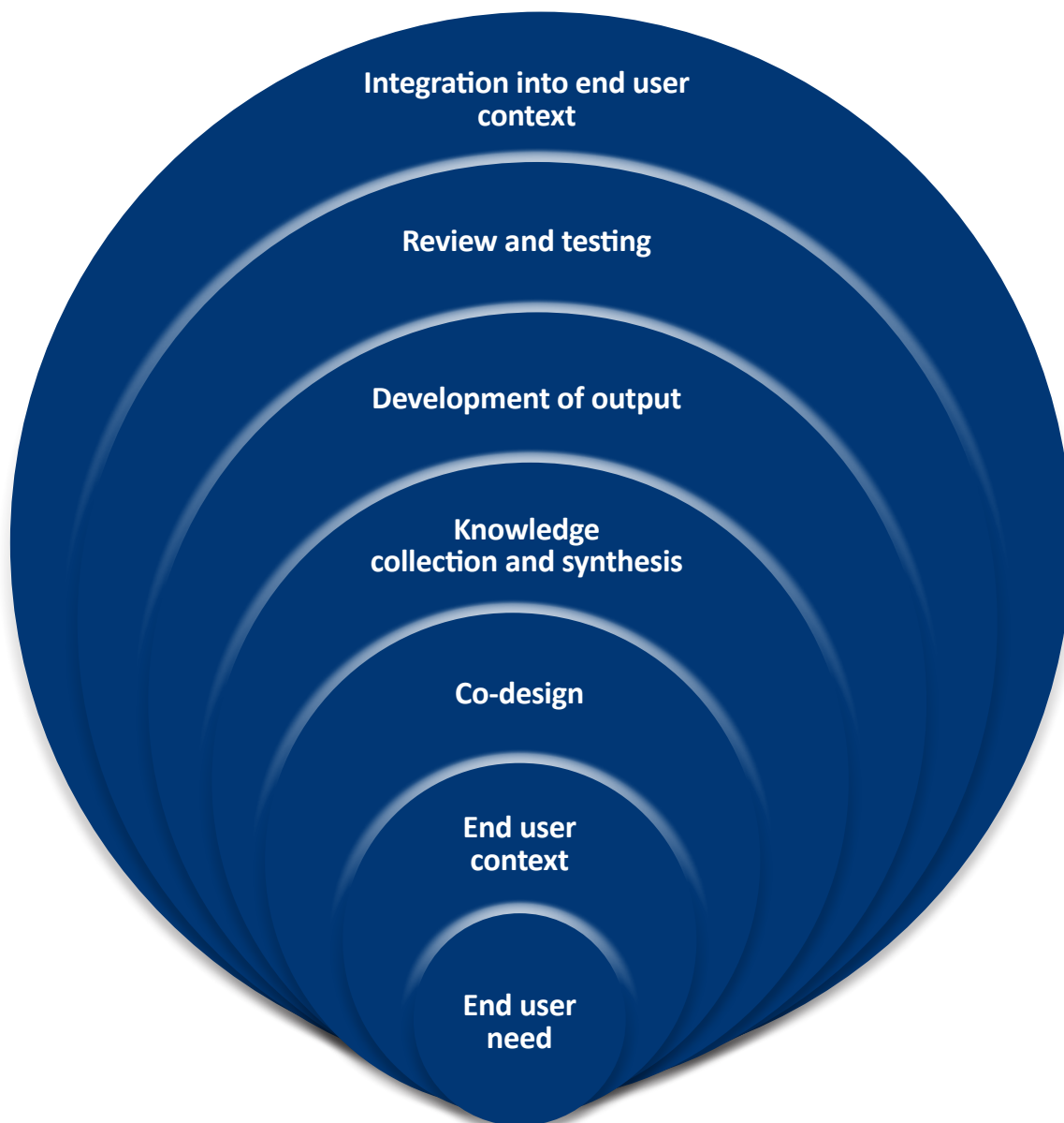
Figure 1: Implementation phases of end user-based research (Young, 2016)

Our team at Victoria University uses an established, end user-based methodology called ‘working from the inside out’, which was developed in 2006. This approach uses systemic analysis that integrates research into decision making as part of the research process. This process co-designs and develops the research and its outputs with the end users to ensure that research products are fit-for-purpose, and able to be used in their decision-making context. Key phases of this process are shown in Figure 1.