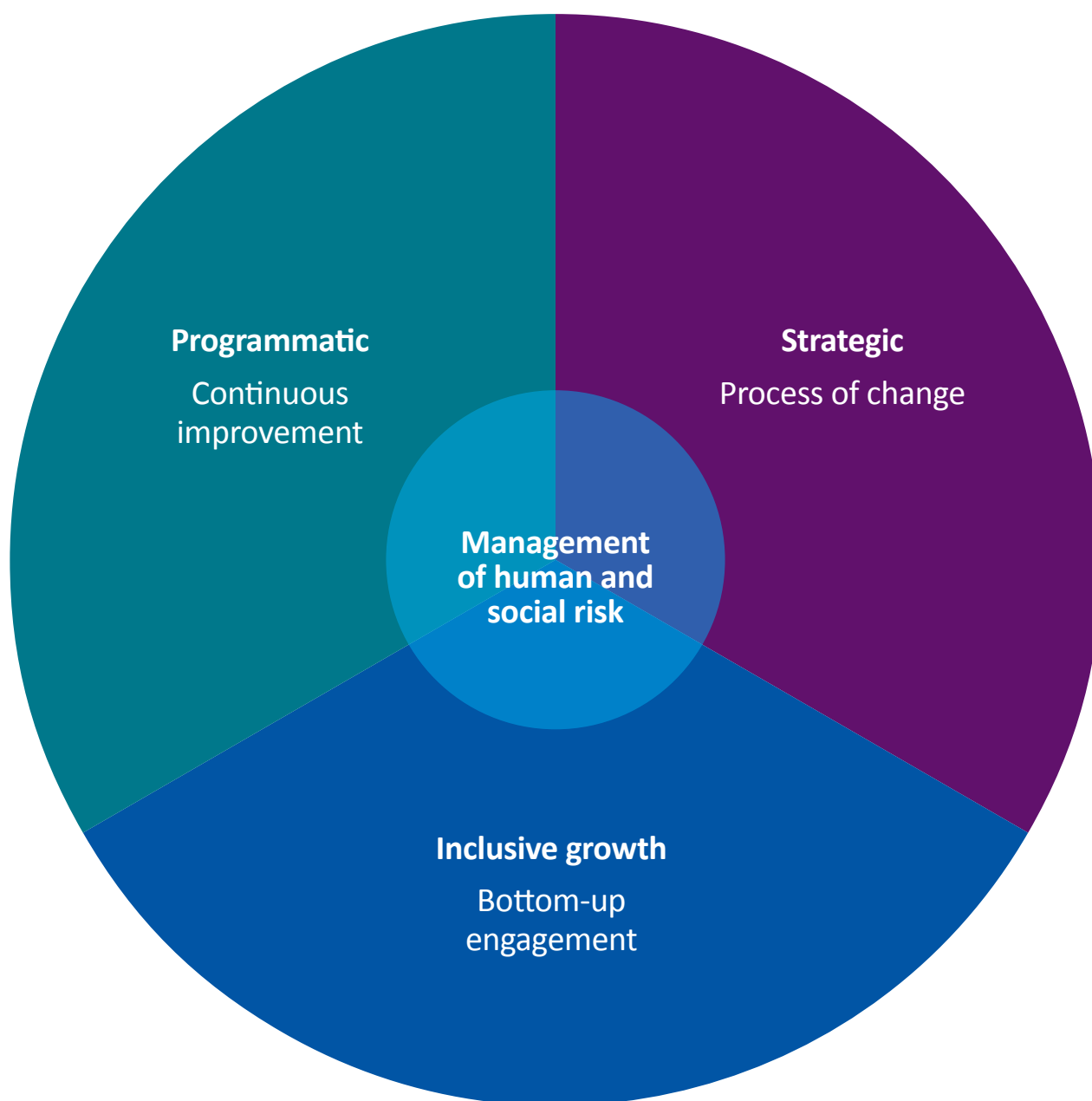
Figure 2: Diversity and inclusion framework components (Young et al., 2020)

The D&I framework to support management and measurement offers a whole-of-system approach, linking four key areas through which D&I can be managed and measured (Figure 3). The key focus is risk management of human and social risk, which provides the starting point for integration across organisational systems, and links it to emergency management practice and day-to-day tasks.