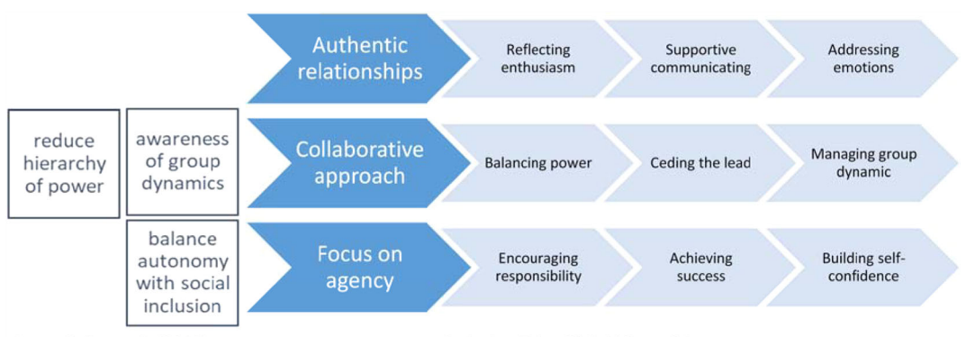
Jones & Deutsch (2010)