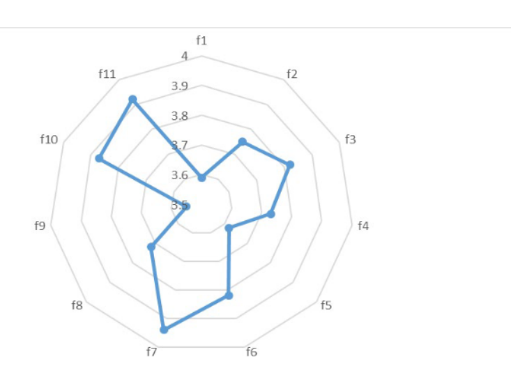
Fig. 1 - Contributory factors to construction payment default in private residential projects