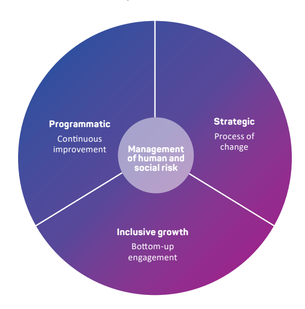
Figure 1: Diversity and inclusion framework components.

This is developed to be flexible and adaptable to aid decision-making in a range of different contexts. The strategic and programmatic processes are supported by guidance and question-focused considerations for practitioners. It also provides implementation areas and key tasks needed across operational areas (see Figure 2).