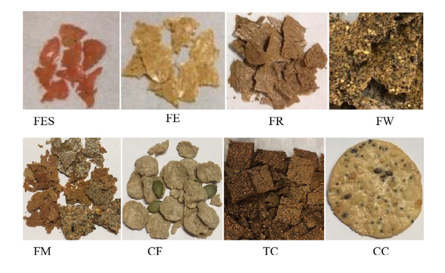
Figure 1 Test and control samples subjected to sensory evaluation. [Colour figure can be viewed at wileyonlinelibrary.com]

Considering that there were no products of Acacia seeds and rhizomes of T. orientalis in the supermarkets at the time of this research, the products selected for controls were based on matching where possible the