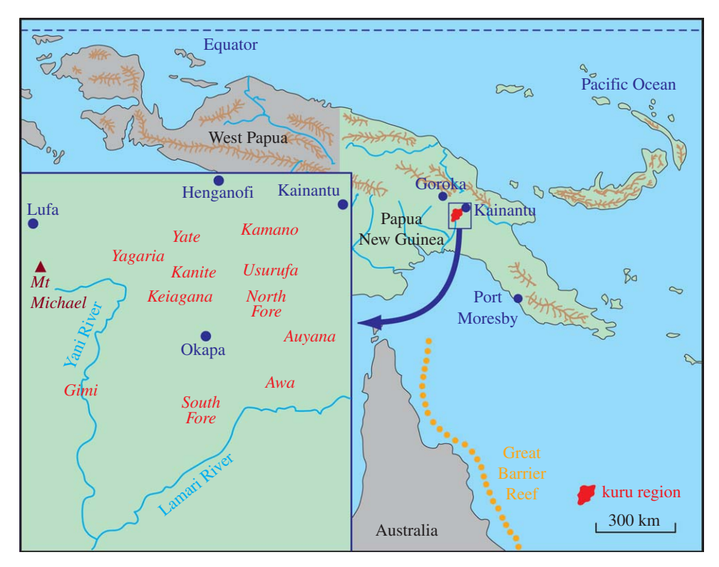
Figure 1. The area and linguistic groups historically affected by kuru in the Eastern Highlands Province of Papua New Guinea.

<sup>a</sup>As males are unlikely to have become infected after the age of 6–8 years (see text), a conservative estimate of the likely minimum incubation period can be calculated as the number of years from age 7 to disease onset.