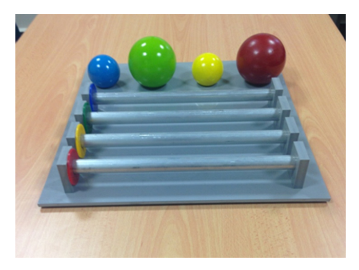
Fig. 1. The size-weight illusion apparatus. Two pairs of objects were presented to the participants one pair at a time. One pair consisted of a small yellow sphere and a large red sphere. Both weighed 120 g. The other pair consisted of a small blue sphere and a large green sphere. Both weighed 405 g. The participants held one object in one hand and the other object in a different hand. After weighing the objects, the participants then adjusted the corresponding slider to indicate how heavy each object was relative to the other, with the left side of the slider corresponding to light and the right side of the slider corresponding to heavy.

Seated opposite the participant at a table, the experimenter gave the following instructions: "I'm going to hand you these colored balls. I want you to tell me how heavy they are using the sliding rings in front of you. If this side [indicating the participant's left] means light and this side [indicating the participant's right] means heavy, slide the ring and leave it wherever you think it should go."