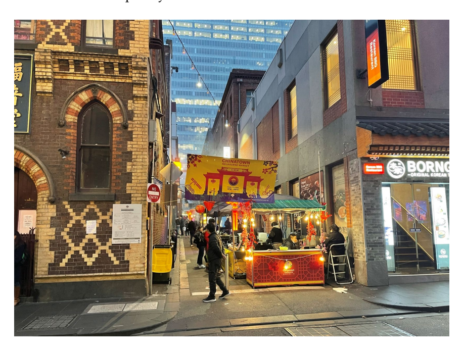
Figure 5. Heffernan Lane night market.

as heritage items and need to be documented while in operation to provide strategies only after the structures become obsolete. Limited spaces within the precinct were transformed into permanent or temporary sites for COVID-19-related functions. However, the discussion between permanent and temporary renovation applies to Chinatown, Melbourne. Many current implementations in the precinct may have an ephemeral nature due to their decorative and temporary nature.