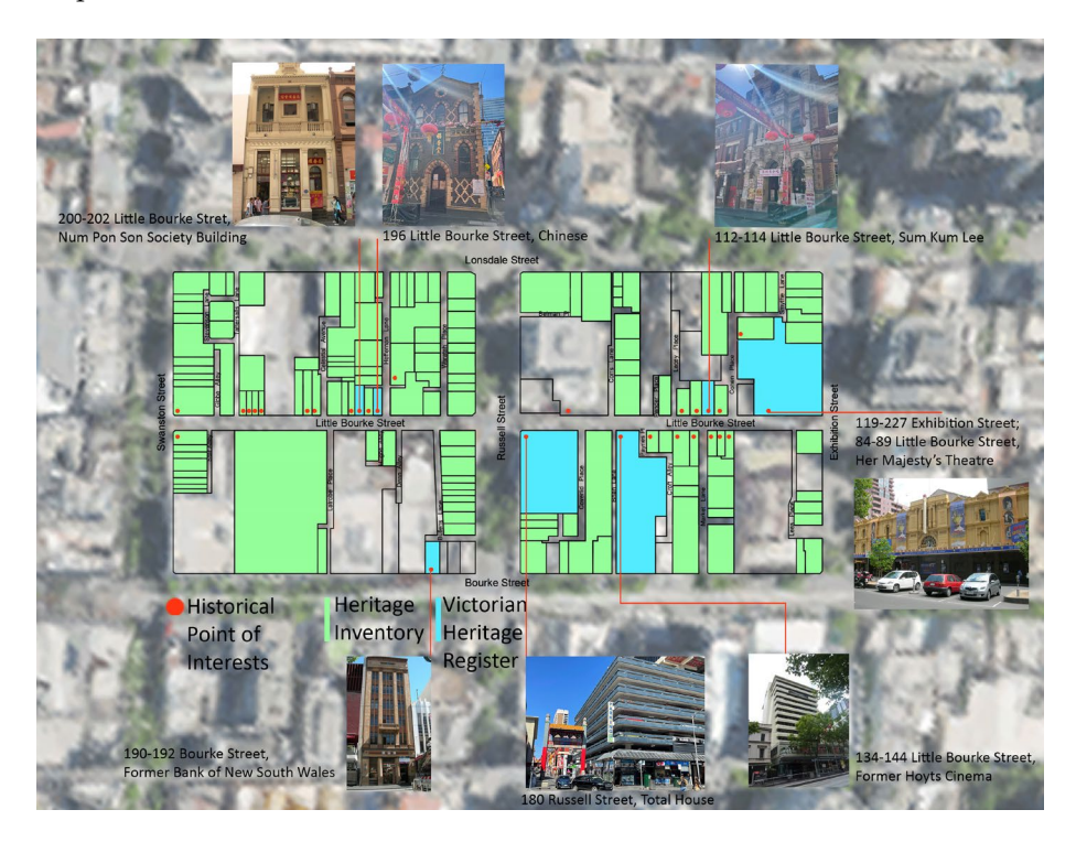
Figure 3. Map analysis with information on Heritage Inventory and Victorian Heritage Register.

A different level of density is also evident during the map analysis (see Figure 3). As a heritage precinct, a need for more emphasis on cultural functions is identified during the field observation. The Victorian Heritage Register does not confine buildings to specific usage. As seen in the filed observation, only three (the Chinese Mission Church, Her Majesty's Theatre, and the Num Pon Soon Society) of the seven Victorian Heritage Register buildings within the enclave still possess cultural functions. Located at the end of the precinct, Her Majesty's Theatre does not necessarily reflect any Chinese-related cultural themes. The limited cultural usage of identified heritage buildings and the tourism focus of the precinct are causing unclear strategies targeting different types of attachment groups. This brings us back to the issue of an identity crisis. Particularly during the pandemic, when tourists were not visiting the precinct, and with limited residents the precinct has undergone a decline in commercial activity [67,74]. Despite the decline during the pandemic, the intensity of Chinese business owners remains the predominant type of attachment within the precinct.