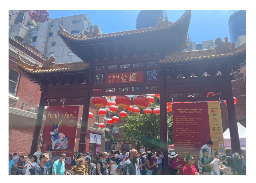
Figure 4. Lunar New Year gathering in Chinatown, Melbourne, outside Cohen Place.

Occasionally, the precinct is used as a gathering spot for Chinese festival events (Figure 4) [70]. Limited spaces within the precinct are occupied with cultural usage in the long term. Although the most-recent direction given by the government in the 1980s suggested Chinatown, Melbourne, should act as a multicultural tourism spot, the precinct nowadays is still mostly that it is 'a place to dine', which has faced a significant decline during the pandemic. However, when the precinct is used to celebrate Chinese festivals, the intensity of the attachment peaks, often causing traffic congestion. According to the official website of Chinatown, Melbourne, (run by the Chinatown Precinct Association), the Lunar New Year and Mid-Autumn festivals are the most celebrated festivals. The Melbourne Dai Loong Association performed dragon dances during those two festivals on Little Bourke Street [75].