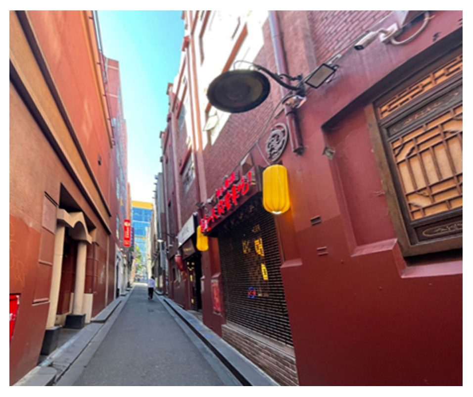
Figure 6. Lunar New Year theme decoration on Tattersalls Lane (source: author SG).