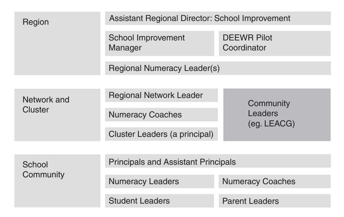
Figure 1. Mathematics Leadership Roles in the Region, Network and School