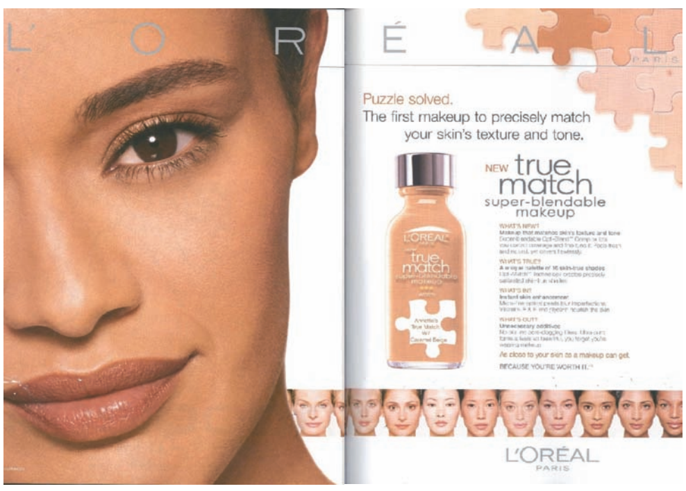
This double page spread for L'Oreal shows women from a range of cultural backgrounds, including both Asian appearance and African. The presence of women from culturally diverse backgrounds is essential to the main advertising message.

By their very nature, advertising messages are designed with a tightly defined target market in mind. Imagery carefully selected for its resonance within one target audience is unlikely to capture the imagination of people who fall outside that market definition.